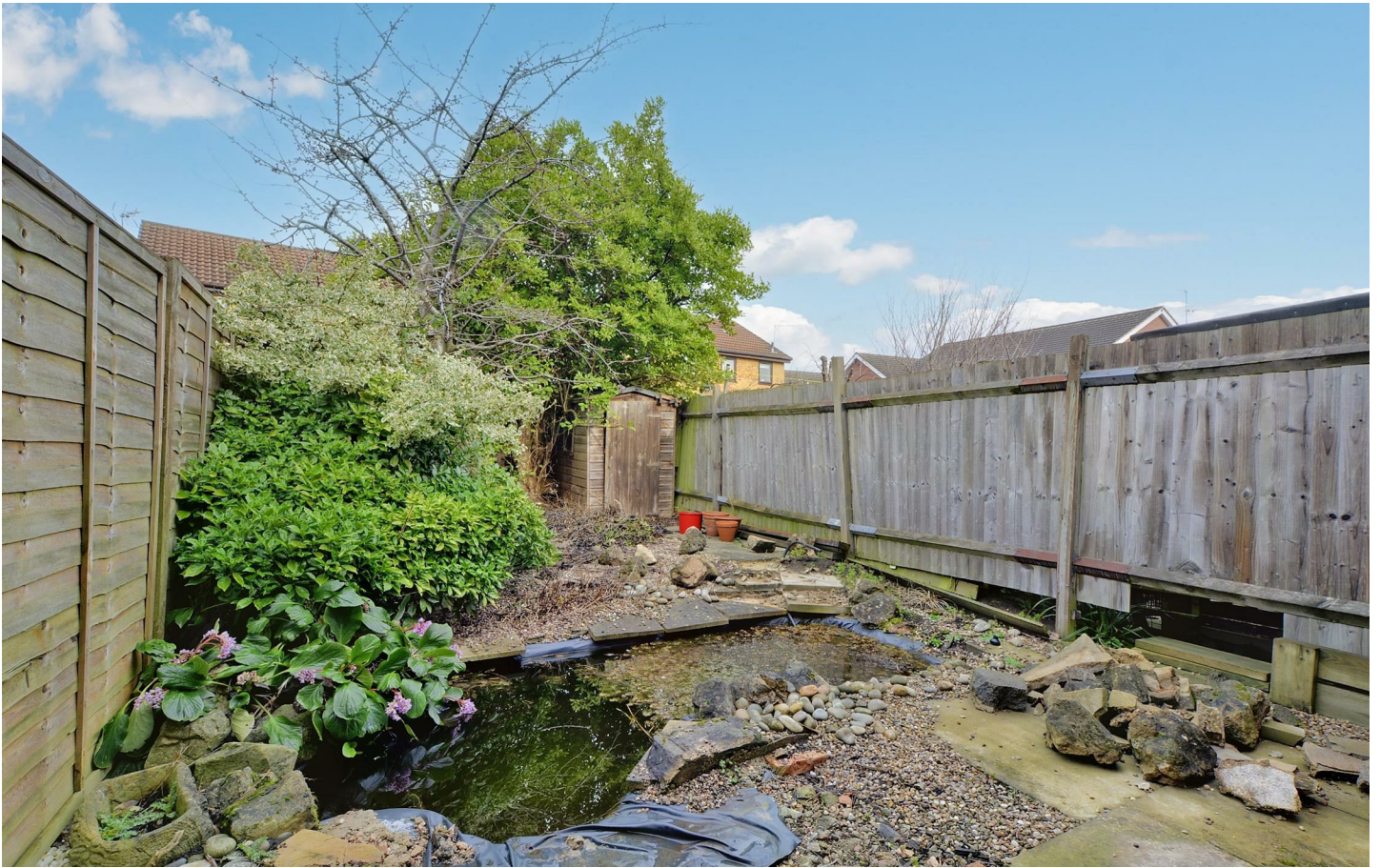
A TWO DOUBLE BEDROOM MID PROPERTY BEING SOLD WITH AN INTEGRAL GARAGE AND THE BENEFIT OF NO UPWARD CHAIN.

Robert Ellis are delighted to bring to the market a property that benefits from gas central heating and double glazing and just needs a little decoration and new floor coverings. The property would ideally suit the first time buyer, growing family or someone looking to downsize. This property is situated on this quiet road which is well placed for easy access to all the amenities and facilities provided by Long Eaton and the surrounding area, all of which has helped to make this a very convenient and popular place to live.